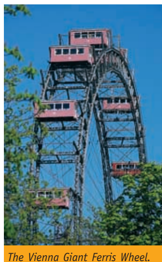
The Vienna Giant Ferris Wheel.